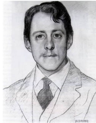
Robert Laurence Binyon, by artist William Strang

Today Binyon's most famous poem, For the Fallen , is often recited at Remembrance Sunday services in the UK; is an integral part of Anzac Day services in Australia and New Zealand and of 11 November Remembrance Day services in Canada. The "Ode of Remembrance" has thus been claimed as a tribute to all casualties of war, regardless of nation.