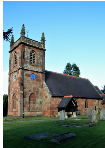
St Luke's, Weston-under-Redcastle