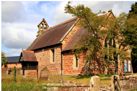
St Peter's, Lee Brockhurst