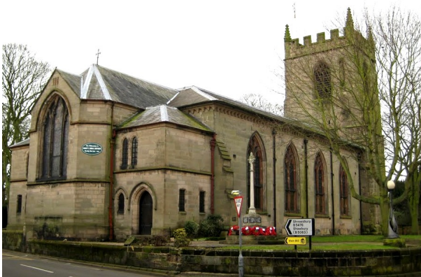
St Peter and St Paul's, Wem